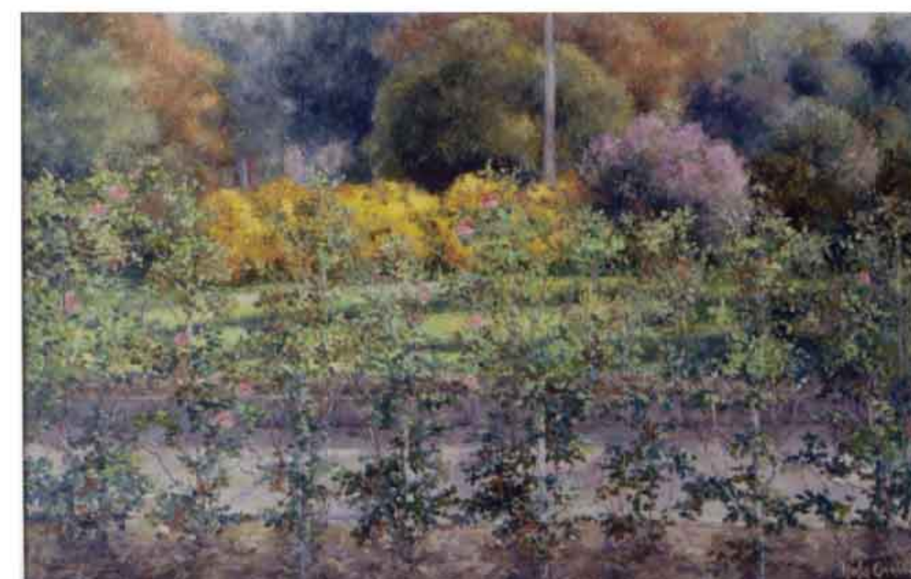
Image: Nola Grabbe, Buss Park , 1980, oil on board. Collection: Bundaberg Regional Art Gallery.

BOOK No bookings required - just turn up!