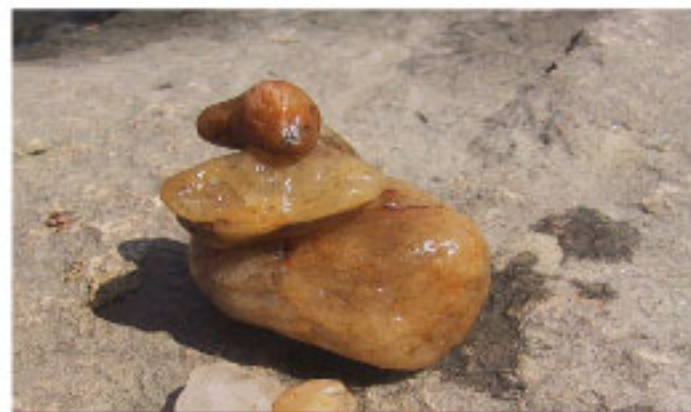
Rocks & Minerals

Explore common features including the head, legs and wings of giant insects and other invertebrates. Specimens include a butterfly, cicada, Giant Burrowing Cockroach, insect wings, snail, stick insect and more. Kit also comes with 4 insect finger puppets and arthropod activities.