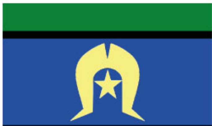
Torres Strait Islands

A fascinating collection of identified rocks and minerals that borrowers can handle, sort and classify according to types, locations and physical characteristics. The Kit includes 18 specimens such as Gypsum, marble, pumice, quartz, calcite, granite and more as well as a hand lens.